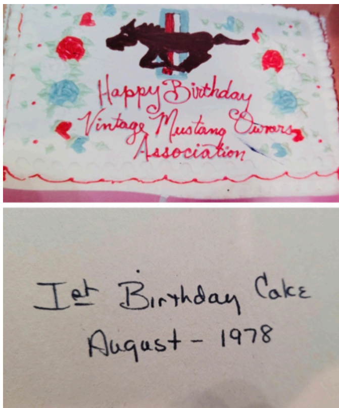
The cake celebrating VMOA's very first birthday