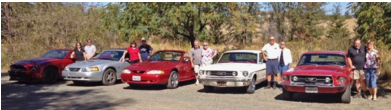
VMOA-ers at one of our many outings over the years