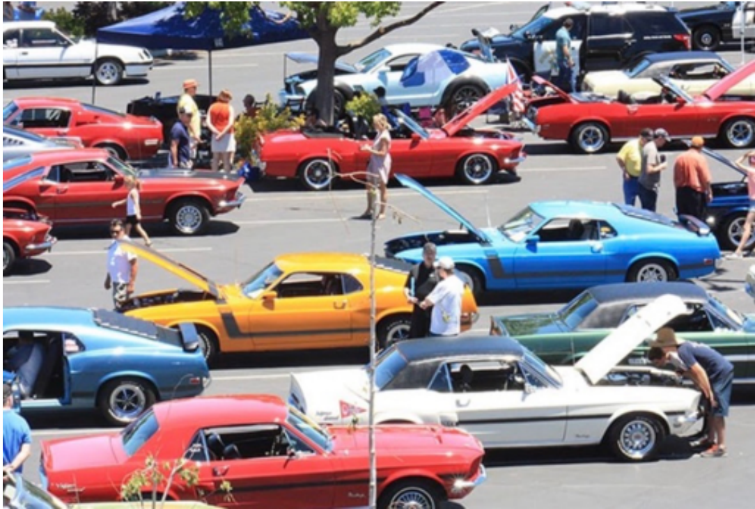
A VMOA car show, circa 2004

We are planning our 2027 50th anniversary car show for next year. As we know, they take a lot of work to put on, but we can do it with your help.