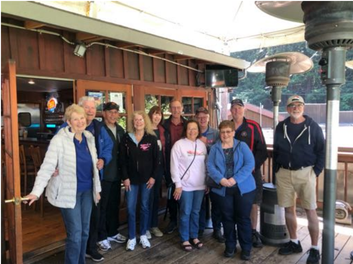
Alice's Restaurant attendees