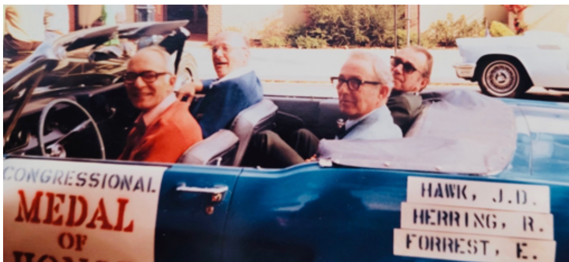
Our very first VMOA parade 1978, in downtown San Jose honoring Medal of Honor winners