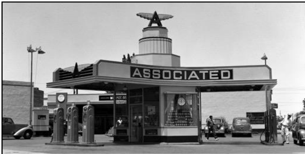
Associated (Flying A) Broadway and El Camino Real Redwood City, 1940

Why write a book on this subject? I've always had a fascination with gas stations ever since I worked in a Flying A service station in San Carlos in the mid-1960s. Like many of you who may have done the same, it was a great job. It paid decent money and gave me a chance to learn about cars, work on my 1956 Chevy and gain the responsibility of waiting on customers, counting the days receipts, checking the gasoline storage tanks, cleaning the station and locking up at night.