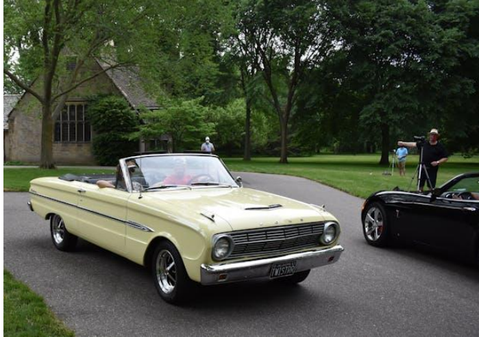
1963 Falcon Convertible

When the very first Mustang galloped onto the car scene at the 1964 World's Fair, there was nothing quite like the pioneering pony car. It was youthful, sexy, and sporty, but also practical, and surprisingly affordable. It was new . In reality, though, what made this new car affordable was that it wasn't new at all, at least not under the skin. The bits that made the Mustang go were from Ford's compact Falcon. The Falcon was already a very successful car, but because of the Mustang's outsized impact—both automotive and cultural—the new and exciting model immediately stole sales from the old and conventional one, and the bird has lived in the shadow of the horse ever since. Sixty years on and now that they're both well-established classic cars, how do they stack up in the market?